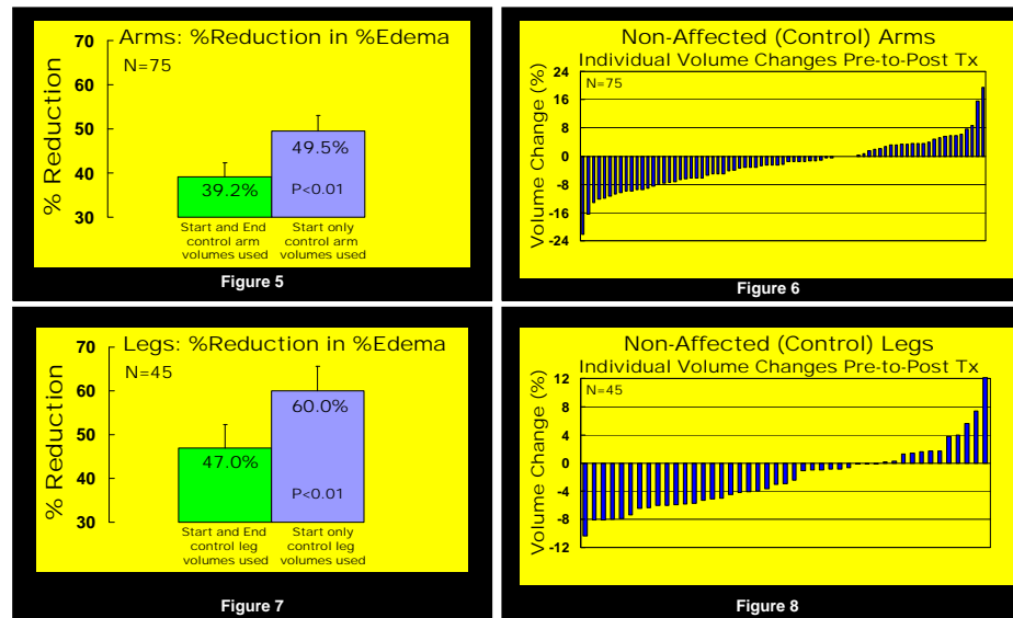
Table 1. Summary of Edema Volumes and Reductions in Unilateral Limb Edema